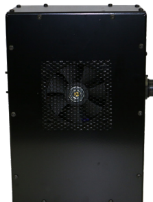
eCoolPark 1.0 AC System