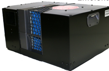
NITE Phoenix AC System