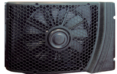
eCoolPark 1.5 AC System