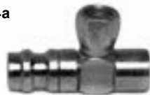
90° 16mm (1/4") Adapter Fitting R-134a