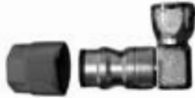
90° 16mm Adapter Fitting R-134a