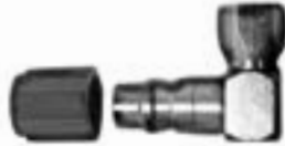
90° 13mm Adapter Fitting R-134a